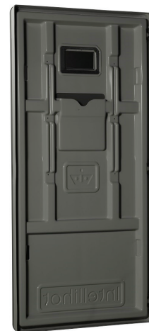
Figure 2: Door (Back) Floor-Standing Unit

The door assembly consists of (5) thermoformed parts – 1 inner, 1 outer and 3 hinge covers – produced out of custom, color-matched Kydex 100. This material was chosen to meet the 746C f1 UL requirements and project timeline. Material thicknesses designed are 0.060" for outer, 0.110" for inner, and .110" for the hinges ( See Fig. 2, 3, 4 ).