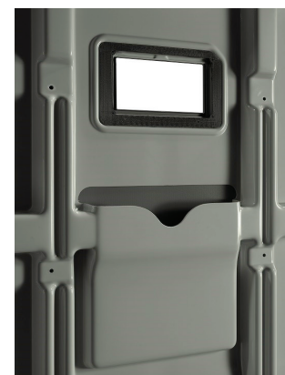
Figure 6: 3D Printed Bracket (black frame – top half of photo)