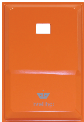
Figure 1: Wall Hung Unit

For the Intellihot project, several critical design and production elements needed to be executed on a short production timeline. SAY Plastics was responsible for redesigning the water heater door and converting it from metal to thermoformed plastic, which required the following ( see Fig. 1 ):