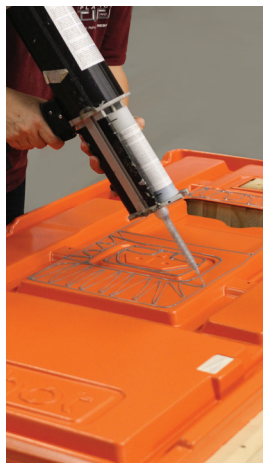
Figure 4: Two-Part Epoxy Assembly

The door assembly with its many value-added features was also accepted for competition and display at the 2018 SPE European Thermoforming Conference in Rome, Italy – demonstrating metal-to-plastic design conversion and collaborative processing.