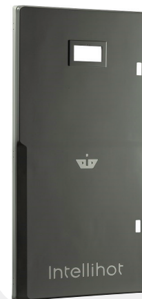
Figure 3: Door (Front) Floor-Standing Unit